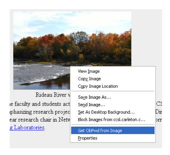
Figure 2: ObPwd extension menu in Firefox